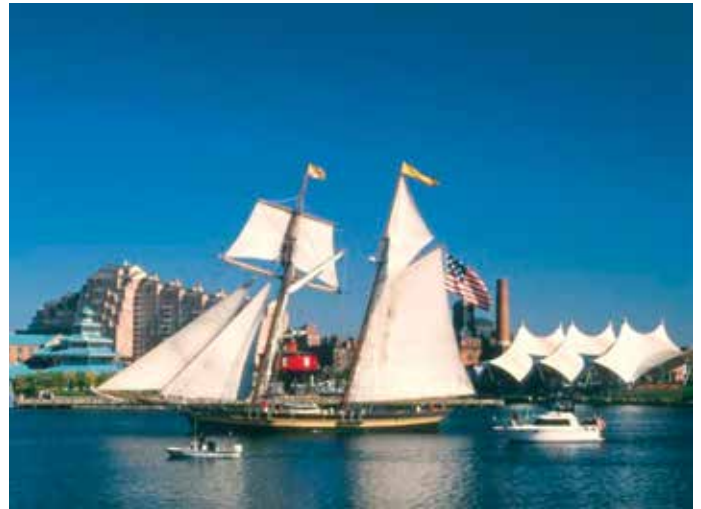
May 14–16, 2015 Marriott Waterfront, Baltimore, MD