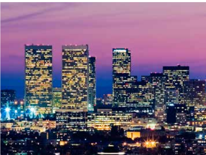
May 19–21, 2016 JW Marriott LA Live, Los Angeles, CA