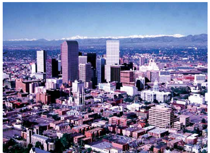
May 18–20, 2017 Marriott City Center, Denver, CO