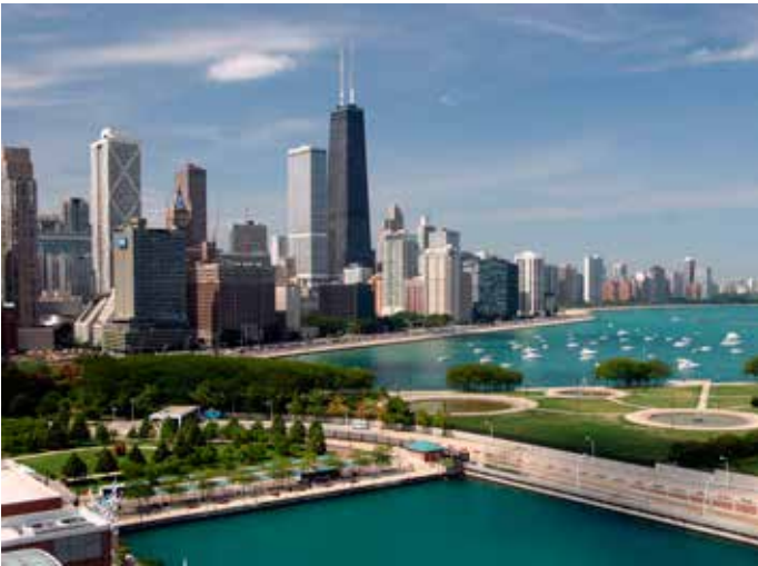
May 15–17, 2014 Fairmont, Chicago, IL