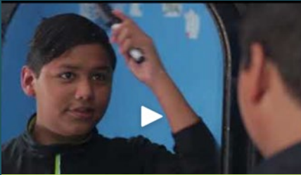
La Familia BYTE