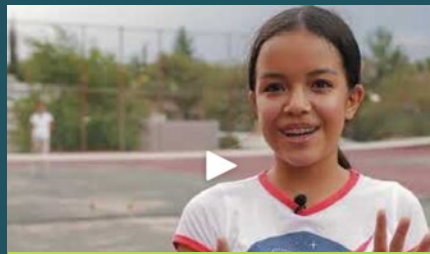
US Open Delegation