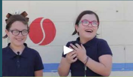
Border Tennis & Tech