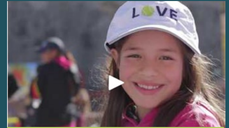
Rally for Border Youth