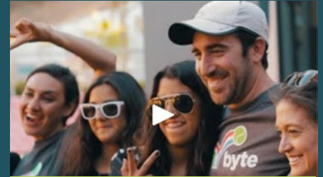
Introduction to BYTE